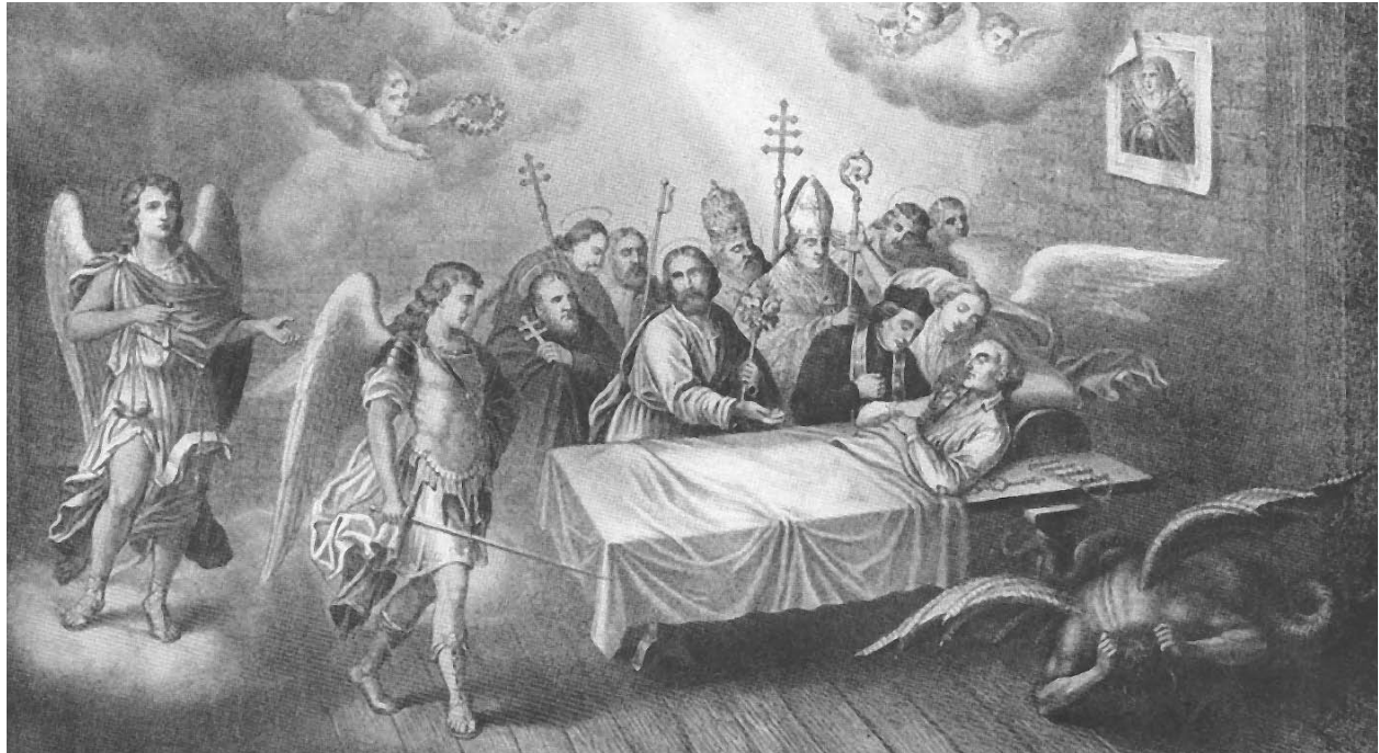
The Peaceful Death of the Just, 19th century lithograph

not force us to love him. He wants us to spend eternity with him — but the choice is ours. We have the chance to turn to Jesus while we are alive, but at the moment of death, our choice is frozen, suspended forever in time (see CCC 1021). We either die in friendship with the Lord or we die out of his grace, in persistent rejection of his love to the end. A person who dies in a state of mortal sin has made a tragic, yet free choice — and will spend eternity separated from God by his or her own choice.