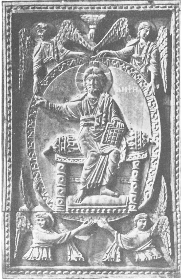
Jesus as Judge, 12th century carved ivory panel

Christian death, then, is a consoling positive reality; we do not have to die alone. The baptized Christian knows that his or her life belongs to Christ and that death is the physical completion of the “dying with Christ” that began at Baptism. Jesus opens up his own death to allow us to die with him; his obedience and love to God the Father can become our obedience: “For if while we were enemies we were reconciled to God by the death of his Son, much more, now that we are reconciled, shall we be saved by his life” (Rom 5:10).