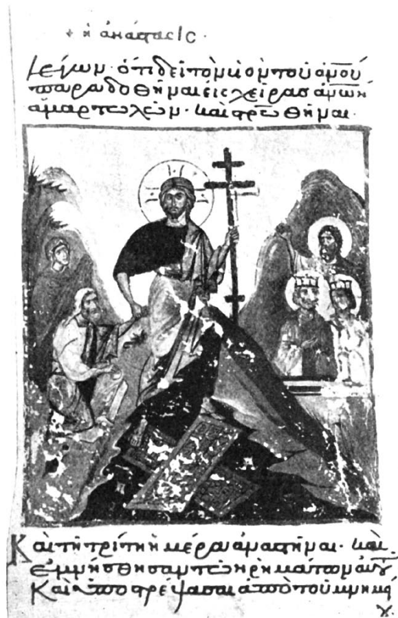
Jesus’ descent to the dead, 12th century book of the Gospels

“If forgiveness is not truly sought after or desired, then God will not offer it. The proper attitude is a yearning to be reunited to God.”