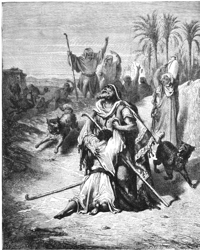
The Prodigal Son, by Gustave Doré, 1855-1885

"Through the priest, God delivers his forgiveness to the sinner."