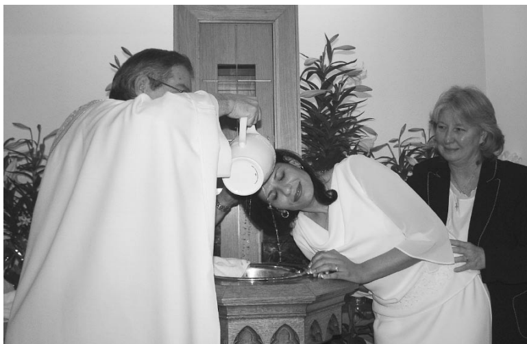
An adult Baptism during the Easter Vigil Mass on Holy Saturday

The theme of Easter morning continues the triumphant joy of the Easter Vigil. It remembers and celebrates the very foundation of Christianity: Jesus is raised from the dead, and is Lord. Those who believe and are