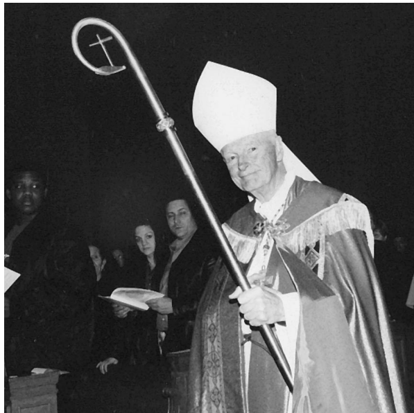
His Eminence Theodore Cardinal McCarrick, Archbishop of Washington, DC from 2001-2006

“On this one day of the entire year, the Mass is not celebrated.”