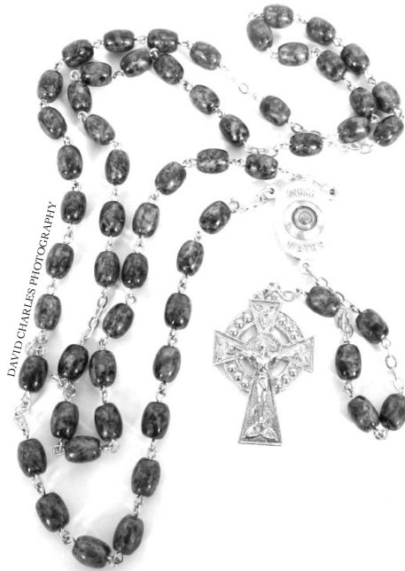
A rosary from Ireland

I confess to almighty God, and to you, my brothers and sisters, that I have sinned through my own fault, They strike their breast: in my thoughts and in my words, in what I have done and what I have failed to do; and I ask blessed Mary, ever virgin, all the angels and saints, and you, my brothers and sisters, to pray for me to the Lord our God.