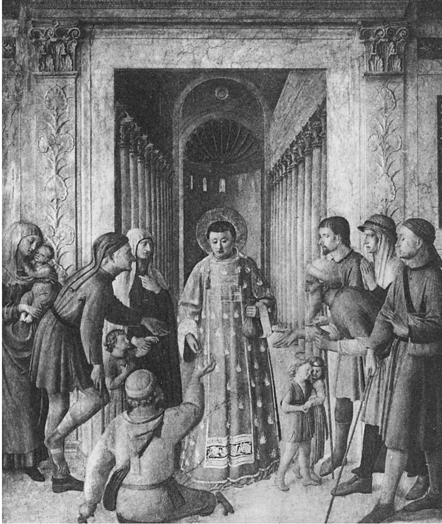
St. Lawrence distributing the treasures of the Church to the faithful, by Fra Angelico, 1587-1455

“Almsgiving is another form of self-denial, that of sharing what we have generously with the poor.”