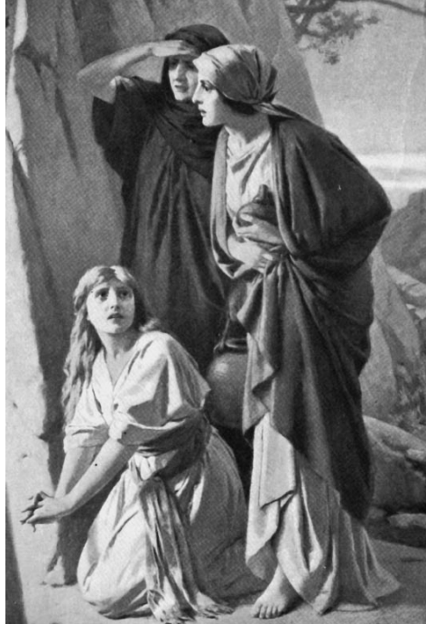
Women at the open tomb on Easter morning, late 19th century lithograph

“Our faith is in Jesus because only he has the words of eternal life.”