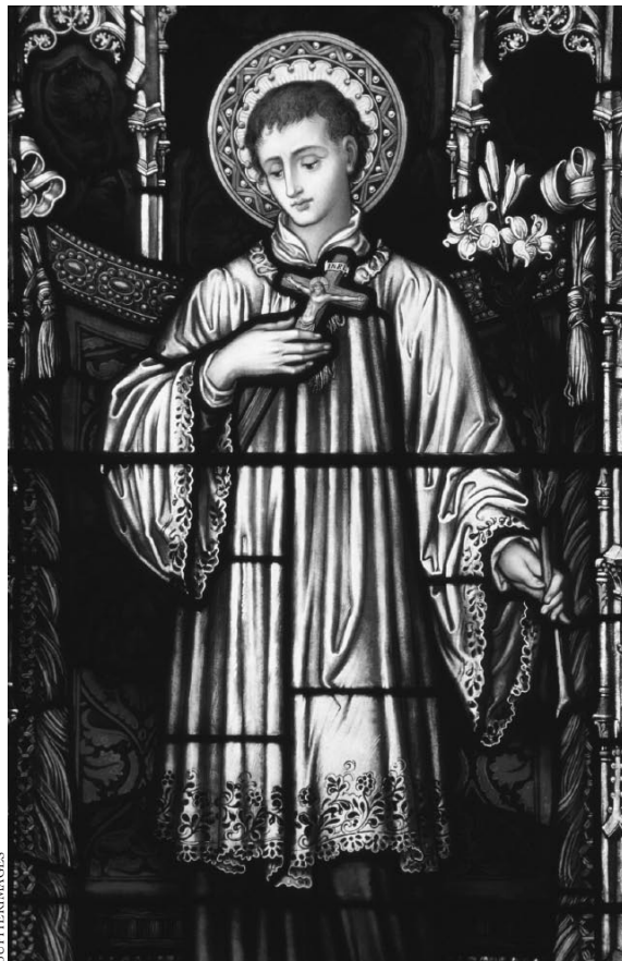
Stained glass window of St. Aloysius Gonzaga, 1568-1591

“The Christian life is really a school of faith.”