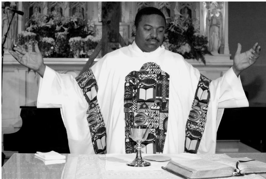
White vestments denote special times of celebration in the life of Church such as Easter and Christmas

The Church calendar has always revolved around the celebration of Easter and the