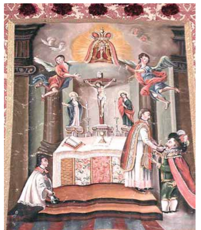
Banner in the Church of St. Oswald depicting the scene of the miracle