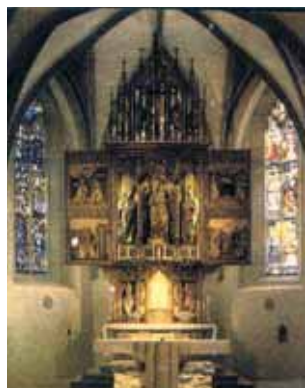
Altar of the miracle