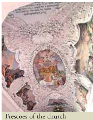
Frescoes of the church depicting the miracle