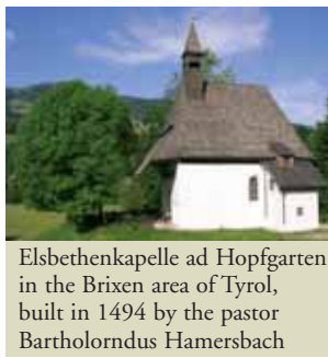
Elsbethenkapelle ad Hopfgarten in the Brixen area of Tyrol, built in 1494 by the pastor Bartholorndus Hamersbach