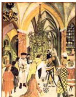
Ancient painting of the miracle