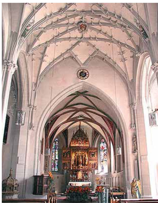
Main altar of the Church of St. Oswald, Seefeld