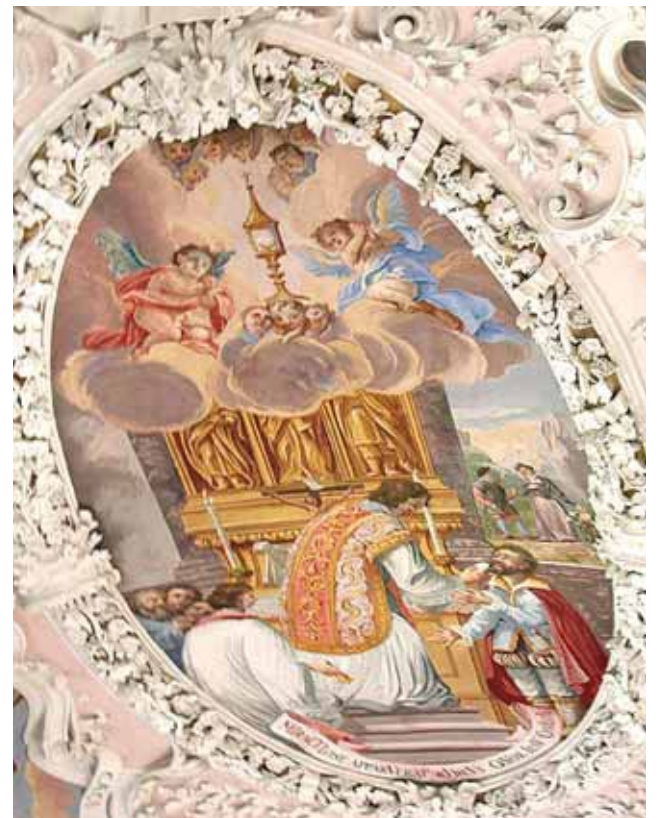
Miracle of Seefeld. Detail of the ceiling

In the little city of Seefeld, Oswald Milser, Lord of Schlosberg, expected, at the Holy Thursday Mass, to receive the large Host like that of the celebrating priest. But at the moment he was about to receive Communion, the pavement began to tremble and broke apart. Oswald grasped the altar so as not to fall, and the priest immediately took back the Host from the man's mouth. The trembling stopped, and live blood began dripping from the Host. There were many witnesses who saw the miracle, and very soon the news spread throughout the whole nation. The Emperor Maximilian I himself was very devoted to it. Today one can visit the Church of St. Oswald where the precious relic of the Host, stained with blood, is exposed, and also view many paintings depicting the miracle.