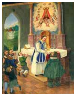
Painting of the Miracle of Seefeld, preserved in the Elsbethenkapelle ad Hopfgarten