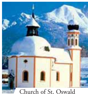
Church of St. Oswald